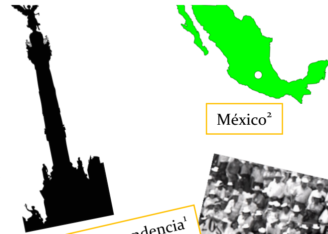
Ángel de la Independencia 1