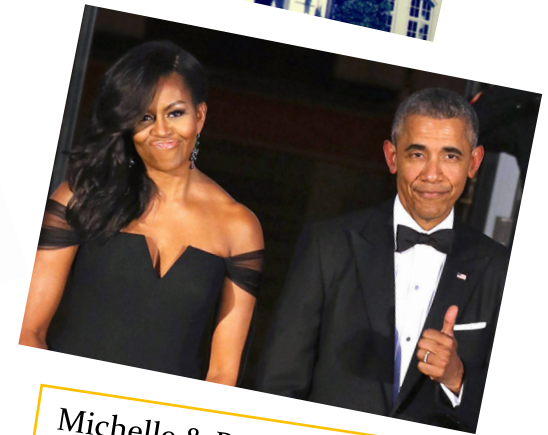
Michelle & Barack Obama 8