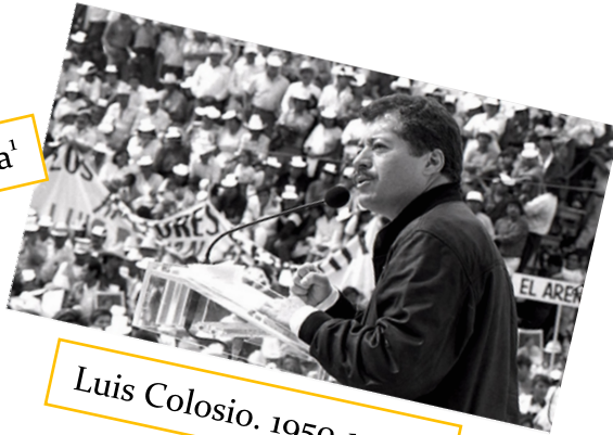
Luis Colosio. 1950-1994. 3