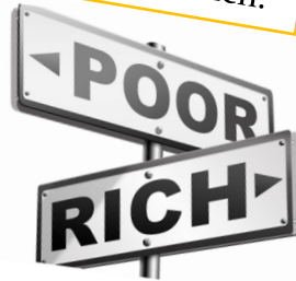
Poor. Rich. 5