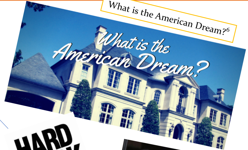
What is the American Dream? 6