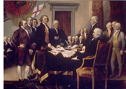
Signing of the Declaration of Independence 9